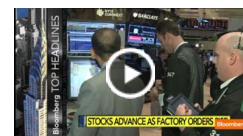
Stocks Advance as Factory Orders Rise