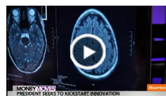
Drugmakers to Benefit From Obama's Brain Initiative